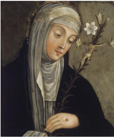
April 29 Patron of Nurses

St. Catherine of Siena Parish (est. 1892)