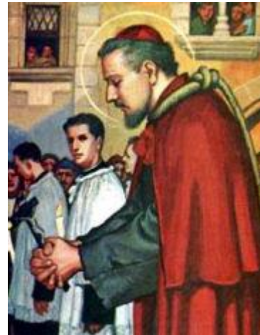
November 4 Patron of Seminarians and Catechists

Oh God, Maintain in your people that spirit with which you inspired your Bishop St. Charles, so that your church may be constantly renewed, conforming itself to Christ and manifesting Christ to the world.